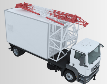
INDOOR TWO COMPARTMENTS